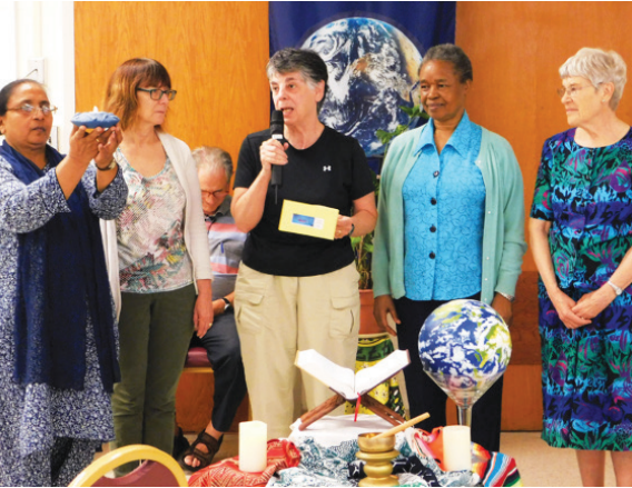
Small group discussion on Multicultural sharing toward One earth Community