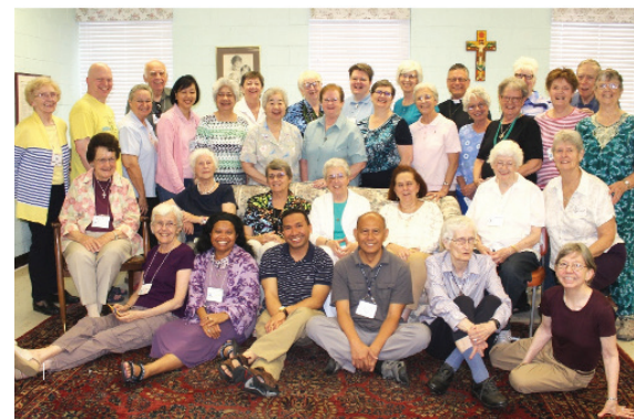
Participants from all walks of life show their joy at participating in their Mission Institute Program