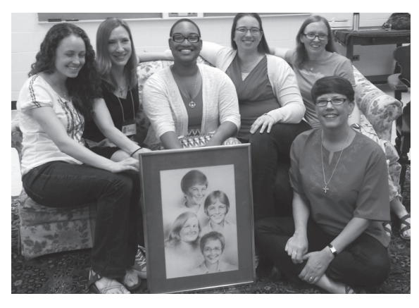
Dominican Sisters Candidates at Mission Institute

D ooted in the prophetic encounter between Jesus Kand the Samaritan woman at the well, we will examine ways in which women continue to use the wisdom of their lived experience to tell their stories about the in-breaking of the Kin-dom of God. We will read excerpts of first-person accounts of feminist visions of a more just world, look at contemporary feminist