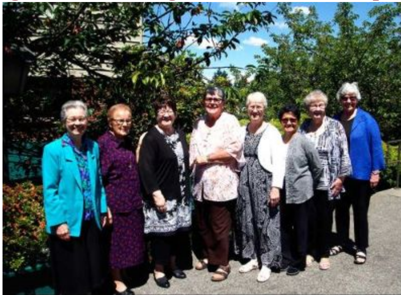
Photo of the Week: Dominican Sisters of Tacoma Creating “Something New” – Celebrating a Covenant Relationship

A web crossroads for the Order of Preachers