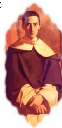
Jean-Baptiste Henri-Dominique Lacordaire 1802 – 1861