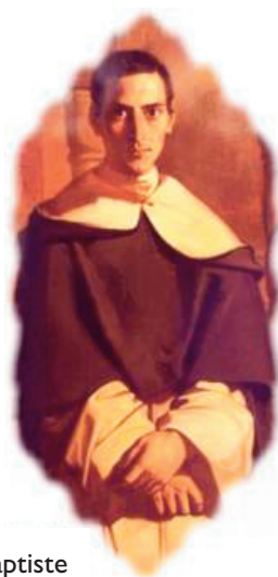
Jean-Baptiste Henri-Dominique Lacordaire 1802 - 1861