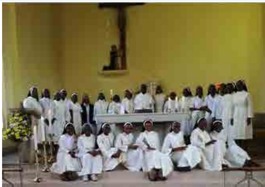
Dominican Missionary Sisters of Sacred Heart of Jesus

by making the committees more creative and meaningful; this was indeed experienced to the full as evaluated at the end of the workshop.