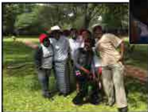
Shared moments of the Workshop