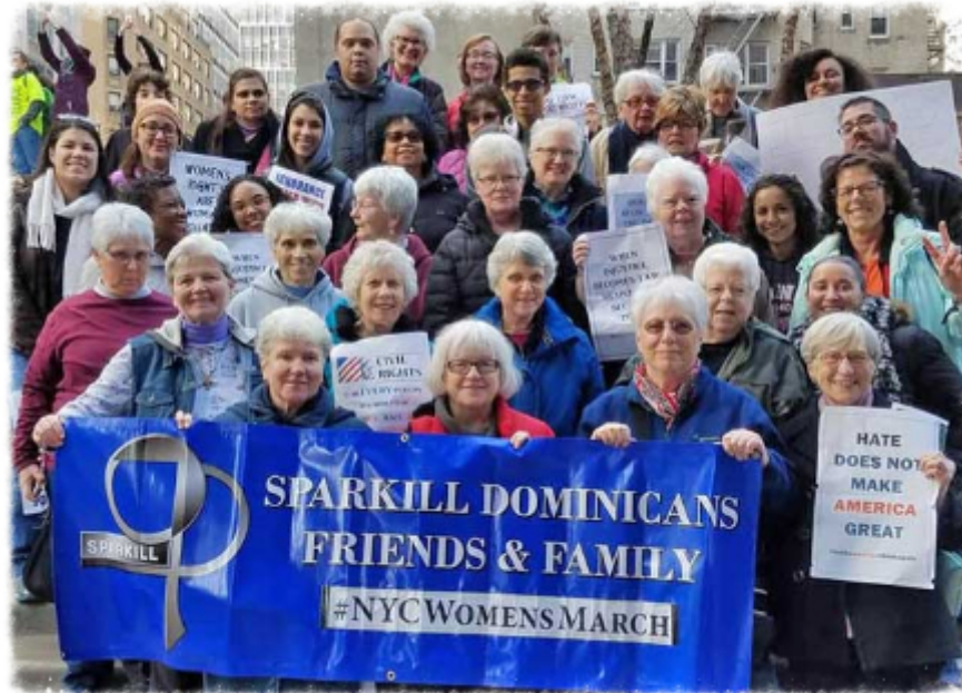
Photo of the Week: Dominican Sisters of Sparkill – Women’s March in NYC

A web crossroads for the Order of Preachers