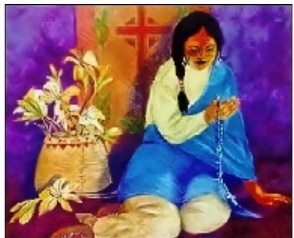
Artwork © Tisket. Used with permission Tekakwitha Conference ~ www.tekconf.org

The Las Casas Board celebrates with Native Americans and all who have anticipated the canonization of the first Native American ~ St. Kateri Tekakwitha!