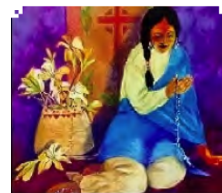
Artwork ©Tisket. Used with permission Tekakwitha Conference ~ www.tekconf.org

Feast Day: July 14 Patron of the environment and ecology