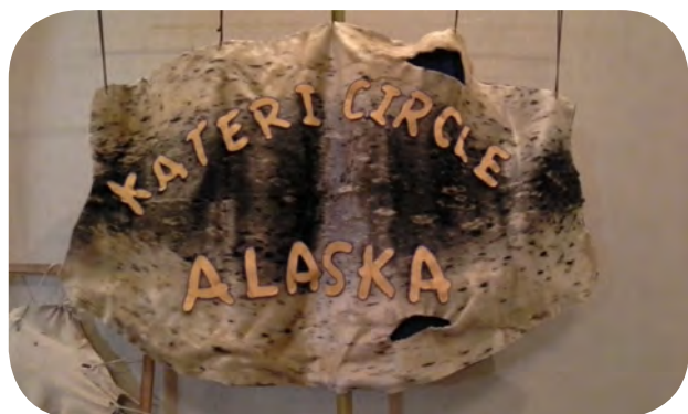
Kateri Circle Alaska picture is used.

Among the highlights of the 75th Tekakwitha Conference was the All Nations Grand Entry. Kateri Circles members processed in with their unique and original banners.