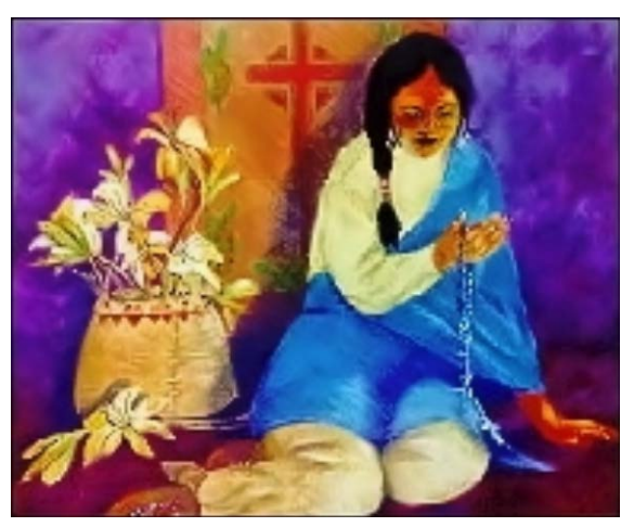
Artwork © Tisket. Used with permission Tekakwitha Conference ~ www.tekconf.org

Feast day: July 14 Patron of the environment & ecology