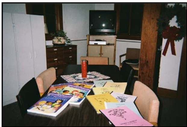
Resources provided by the Las Casas grant - Children's Liturgy of the Word K-6 and a set of high school religion resources.

The youth appreciate Las Casas donors who made it possible for them to find meaning in the Catholic way of living; for through these books they are led to reflect on their heritage and the ways of their ancestors. Then they learn how their own traditions relate to the teachings and practices of the Catholic Church.