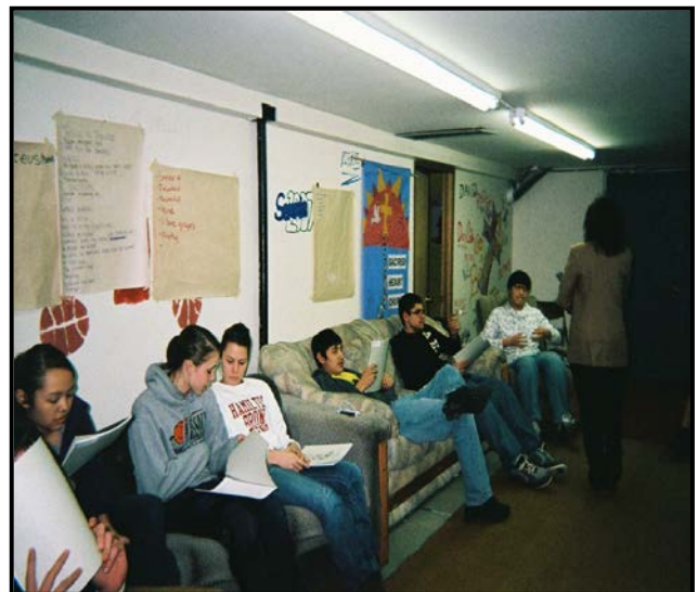
The high school youth of Sacred Heart Arlee and St. John Berchman/Jocko are enjoying their new acculturated religion books.

Thanks to Las Casas for a grant for the year 2010, the high school youth of Sacred Heart Mission in Arlee and Saint John Berchman/Jocko, Montana were granted their wish. When the youth were asked what they would like in their catechetical sessions, a number of them responded that they wanted to study from religious education resources that were developed from their own culture. The Las Casas grant made possible the purchase of 20 books (each of a series of 8 books) published by the Tekakwitha Conference.