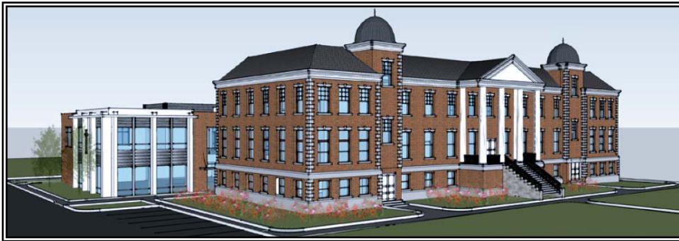
The new St. Dominic Priory is an historic Catholic landmark built in 1908 and situated near our School of Theology, Aquinas Institute, in midtown St. Louis. This rendering also shows the adjoining new Dominican Commons.

New construction will provide the common dining and meeting areas that are essential to Dominican community life. The building is situated on about an acre of land at 3407 Lafayette Avenue in midtown St. Louis. It is adjacent to the Medical School of Saint Louis University and near Aquinas Institute, Our Dominican center of theological, philosophical, and pastoral studies.