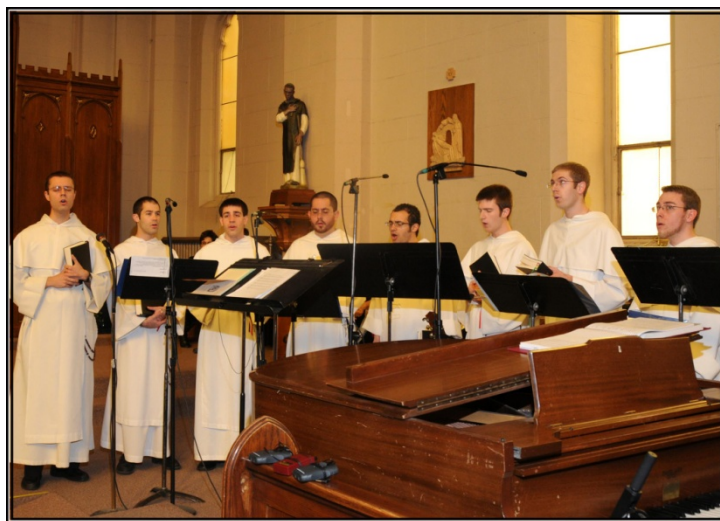
Our Novices Celebrate at St. Dominic Parish in Denver

Although bricks and mortar do not make the Dominican, each of us is molded by the space in which we live and work. We are confident that our new studentate will shape the vocations of the young men who will live there by offering them ample room to pray, to study, and to be formed together as Friars Preachers.