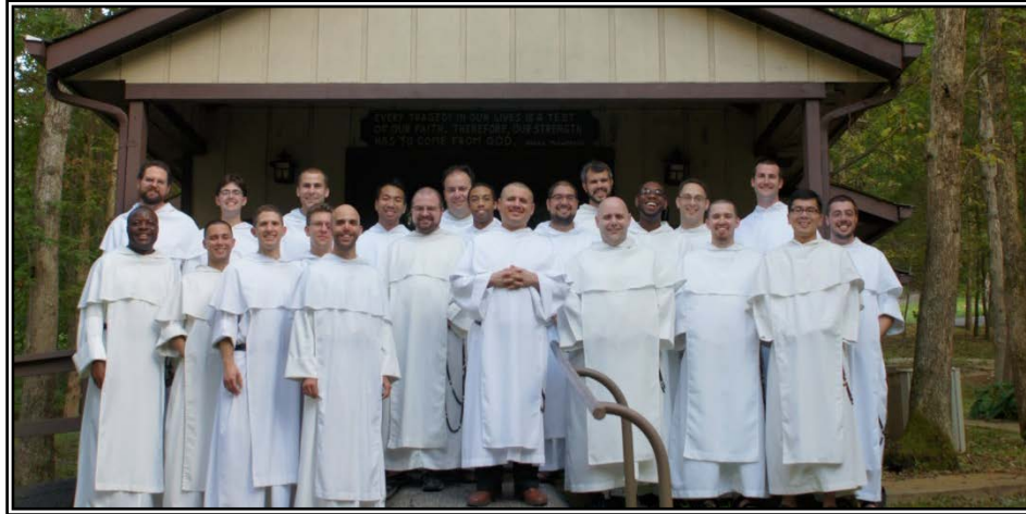
Our Student Brothers on Retreat

Responding to the blessings of many gifted and faith-filled young men who wish to serve the Church as Dominican friars, the Province of St. Albert the Great has embraced an extraordinary opportunity for our future growth.