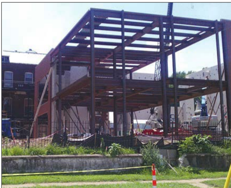
The framing for the new Dominican Commons is erected!