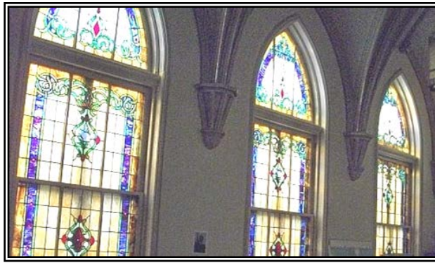
The chapel windows are artisan-crafted original vintage works of stained glass.

We are transforming the former Loretto Academy into simple residential rooms for our Dominican student brothers and the priests who help form them. The Chapel is in good condition with hardwood flooring and 10 vintage stained glass windows. This inspiring sacred space will serve as the heart of our regular shared worship and liturgical prayer.