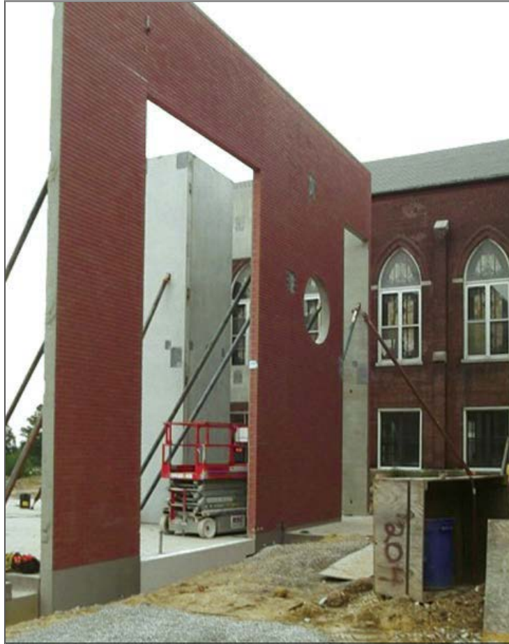
The walls for the new Dominican Commons are raised!

For the latest project updates, visit us at www.stdominicpriory.com .